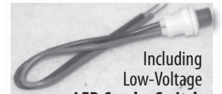
Including Low-Voltage LED Combo Switch